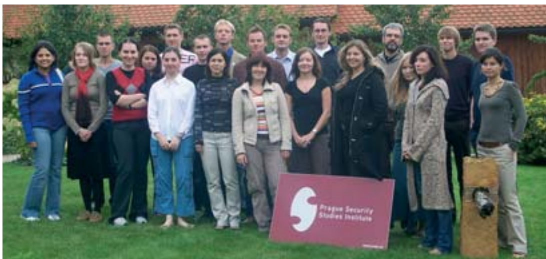
Participants of the PSSSI's NATO Summer School 2008