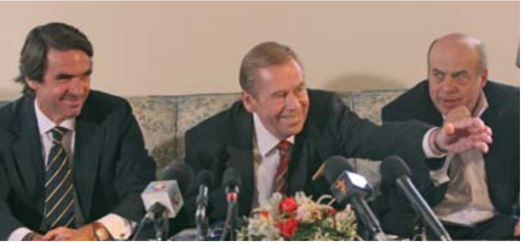
President of the FAES Foundation José María Aznar, Former Czech President Václav Havel and Chairman of the Institute for Strategic Studies at the Shalem Center Natan Sharansky (from left)