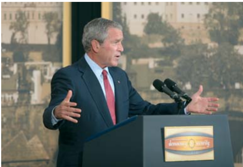
President of the United States George W. Bush