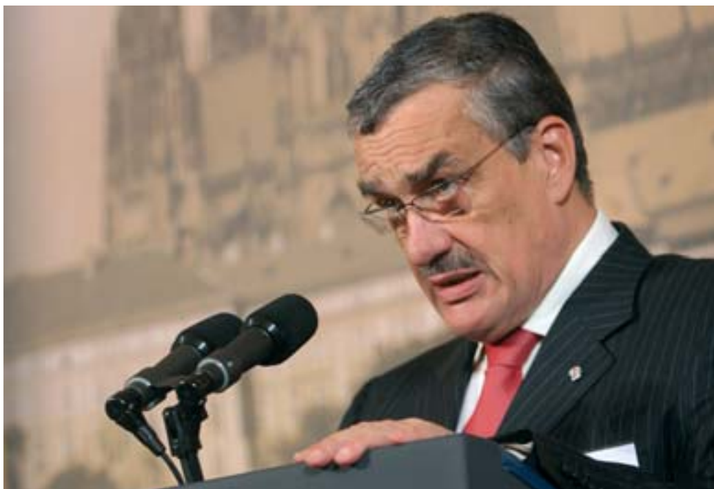
Minister of Foreign Affairs of the Czech Republic Karel Schwarzenberg