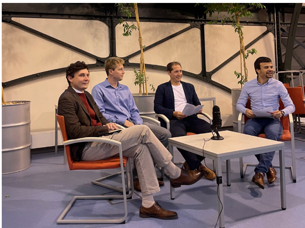
Public debate about the topics trending on disinformation websites in the run-up to the parliamentary elections

Balkan countries. Findings of the report were then presented on two occasions — first, at a closed roundtable attended by politicians and state institutions' representatives, and second, at a public event co-organized with the U.S. Embassy in the Czech Republic.