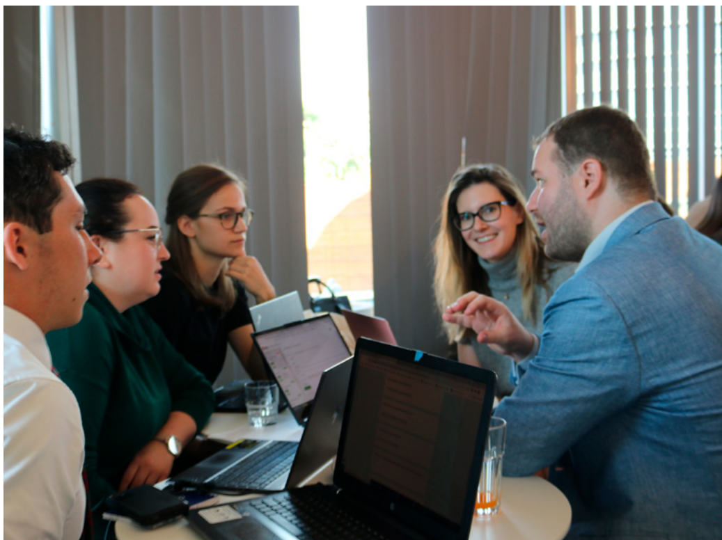
Participants of the Cyber Security Academy during a table-top exercise ran by CybExer Technologies

Additionally, in September 2021, PSSI became a part of a Visegrad Fund project, "Western Balkans Trends – Exploring Trajectories for the Region" organized by the Polish Res Publica Foundation, in cooperation with five other Central and Eastern European NGOs – the Belgrade Fund for Political Excellence, the Research Center of the Slovak Foreign Policy Association, EUROTHINK – the Center for European Strategies, the Institute for Foreign Affairs and Trade, and the Albanian Institute for International Studies.