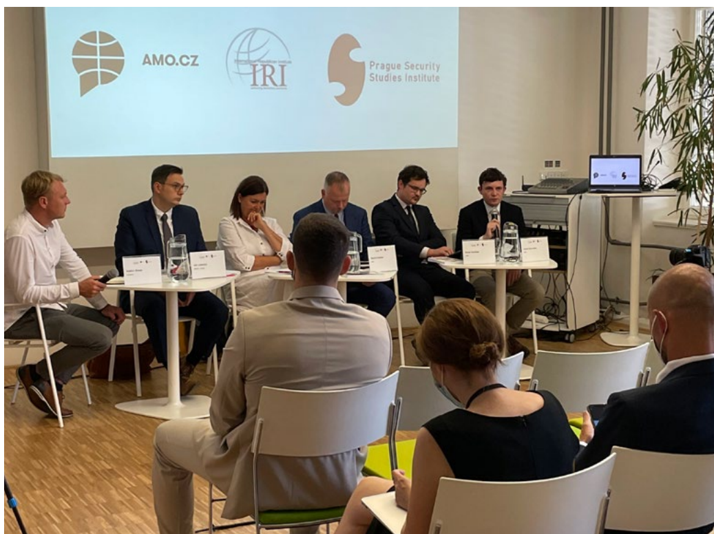
PSSI organized a discussion of political representatives about the societal resilience in the V4, EaP countries and Western Balkans