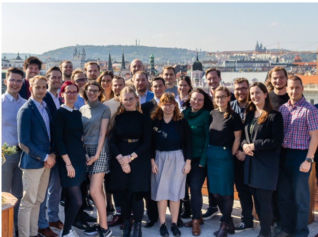
Participants of the Cyber Security Academy 2021

well as new challenges emerging from the pandemic situation.