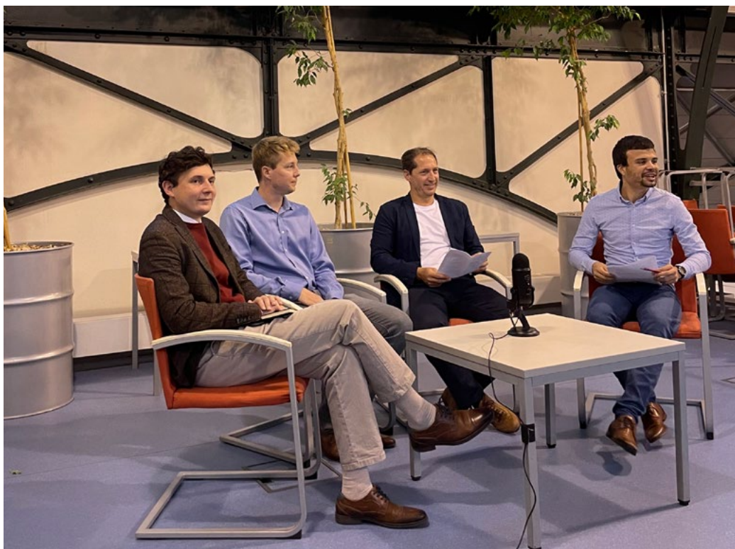
Public debate about the topics trending on disinformation websites in the run-up to the parliamentary elections

Balkan countries. Findings of the report were then presented on two occasions — first, at a closed roundtable attended by politicians and state institutions' representatives, and second, at a public event co-organized with the U.S. Embassy in the Czech Republic.