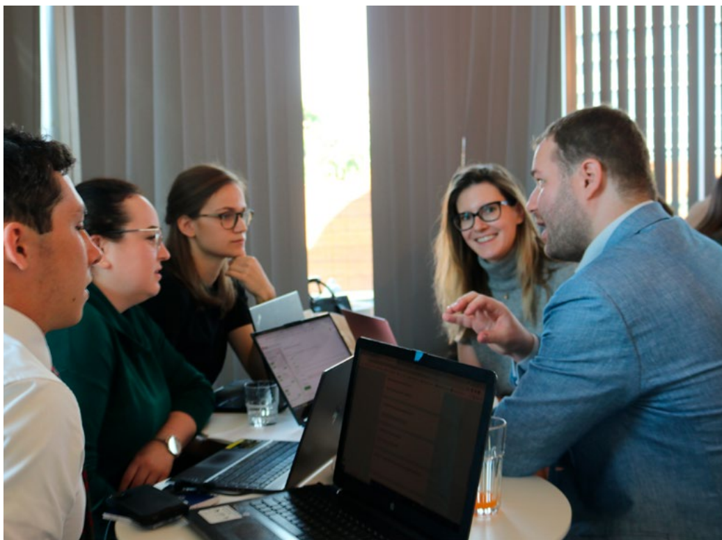
Participants of the Cyber Security Academy during a table-top exercise ran by CybExer Technologies

Additionally, in September 2021, PSSI became a part of a Visegrad Fund project, "Western Balkans Trends – Exploring Trajectories for the Region" organized by the Polish Res Publica Foundation, in cooperation with five other Central and Eastern European NGOs – the Belgrade Fund for Political Excellence, the Research Center of the Slovak Foreign Policy Association, EUROTHINK – the Center for European Strategies, the Institute for Foreign Affairs and Trade, and the Albanian Institute for International Studies.