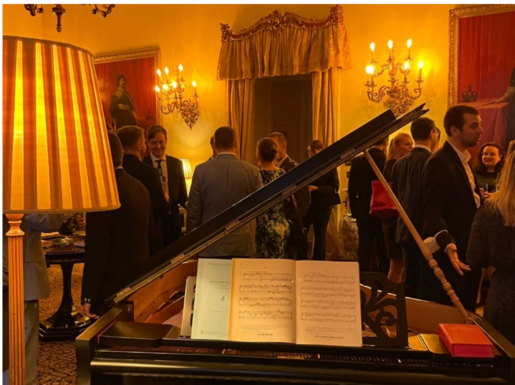
Reception celebrating the UK-Czech bilateral co-operation in cyber security, hosted by the British Ambassador Nick Archer on the occasion of Cyber Security Academy