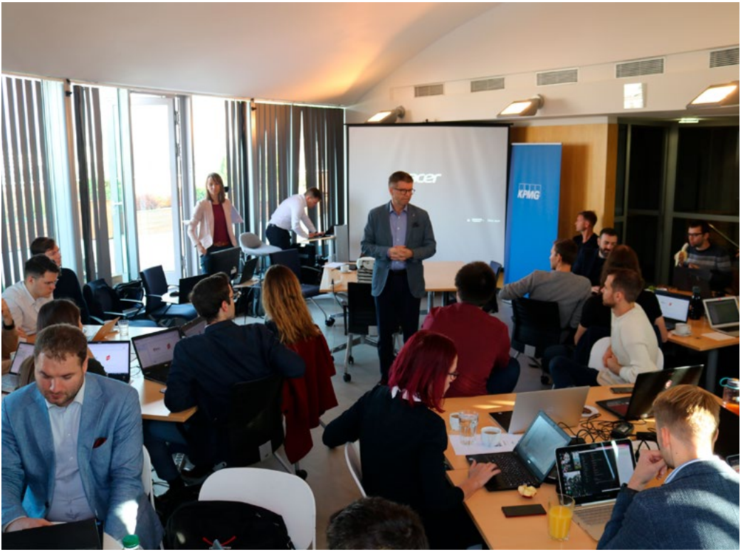
Participants of the Cyber Security Academy during a table-top exercise ran by CybExer Technologies

involvement of decision-makers at national levels; coordination in international fora; and raising public awareness. It brings a multidisciplinary approach to, and an update on, global space activities, a structure for a Space Traffic Management regime, and a concrete roadmap for implementation with a timeline.