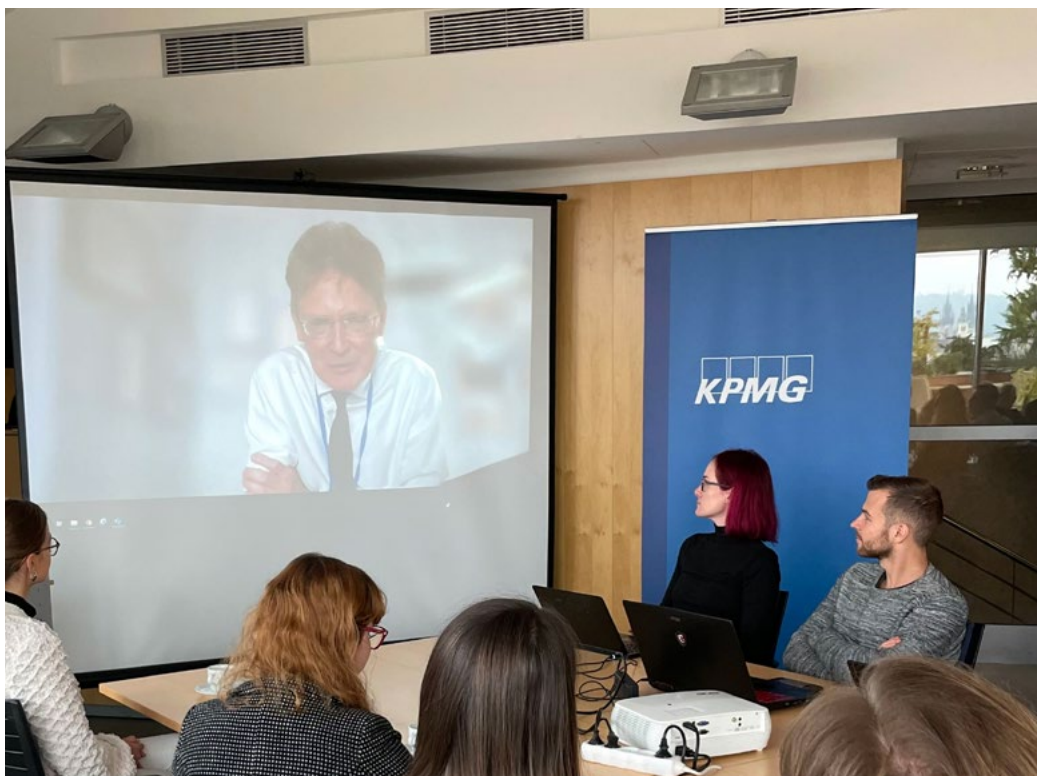
British Ambassador Nick Archer greets the participants of the Cyber Security Academy

European Space Policy Institute (ESPI), and the Secure World Foundation.