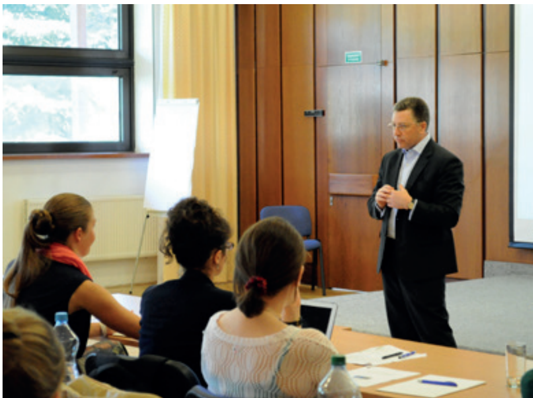
Former U.S. Ambassador to NATO Kurt Volker addressing Summer School students

practical experience wherever possible. In so doing, we will be making a significant contribution to producing future government and private sector policy practitioners and executives with a rich, nuanced energy security background and a sophisticated, global perspective.