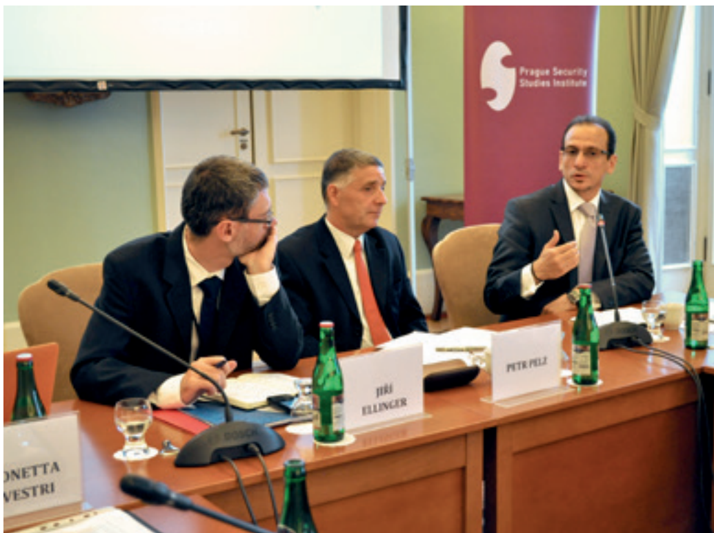
Expert roundtable on Security Sector Reform in Libya

missile defence in Europe, NATO-Russian cooperation, and prospects for NATO after the US presidential election in November 2012.