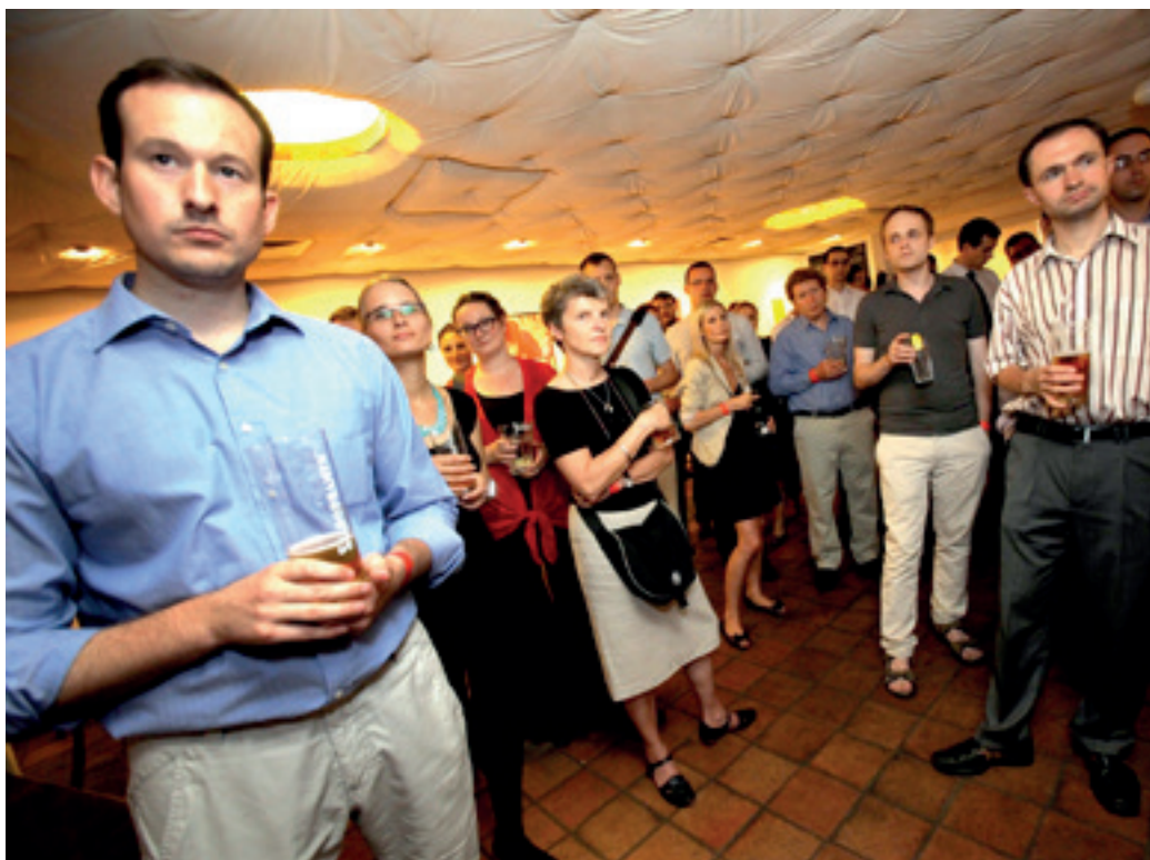
PSSI's alumni and friends at the PSSI's 10 th anniversary party

and facilitate information exchanges among students and young professionals. Today, PSSI's "extended family" accounts for more than 400 graduates from around the world.