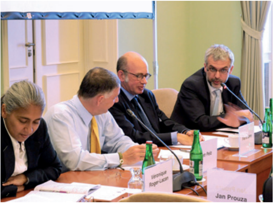
International conference "Sahel: Security Challenges"

Through a Trilateral US-Europe-Japan Partnership." The event took place on October 30–31, 2013 in Tokyo, Japan. The international conference was held under the auspices of the Office of National Space Policy of the Prime Minister's Cabinet Office, with the support of the Ministry of Foreign Affairs and the Ministry of Defense of Japan.