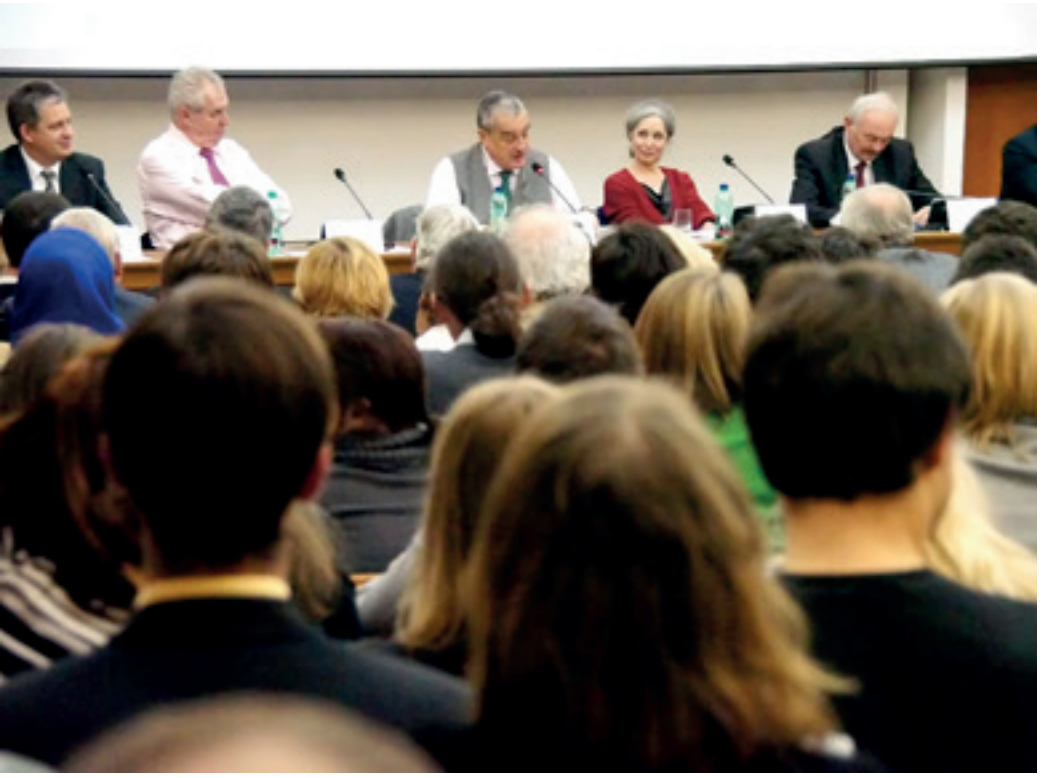
Presidential debate on foreign policy