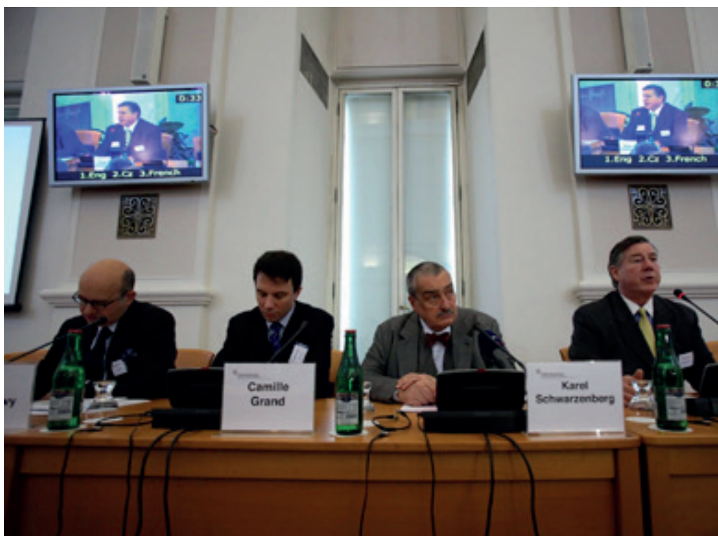
International conference "Ensuring Energy Security in Europe – the Need for a Multifaceted Approach"