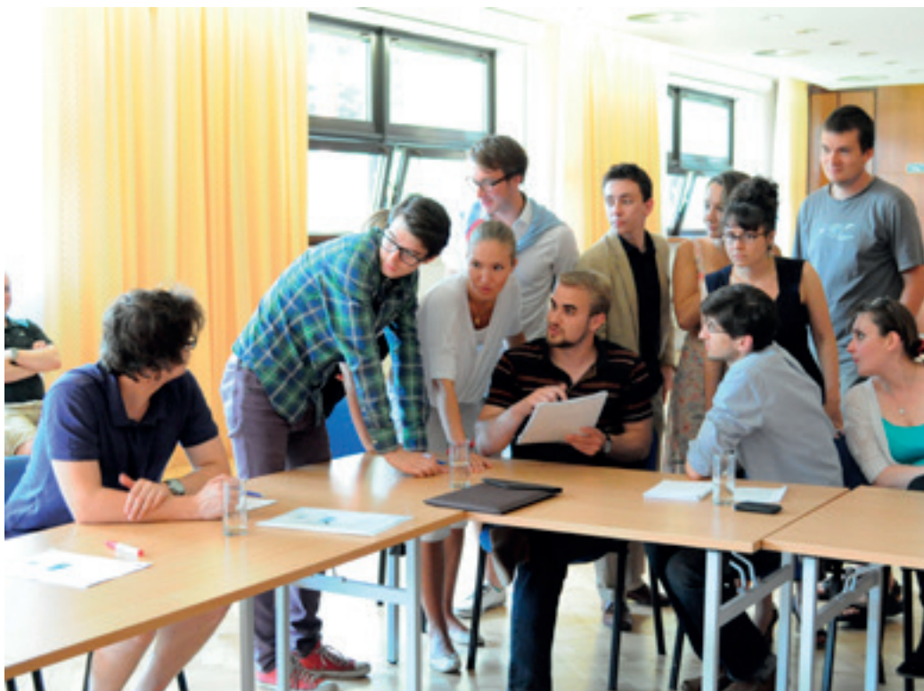
Participants of the PSSI's Summer School 2013