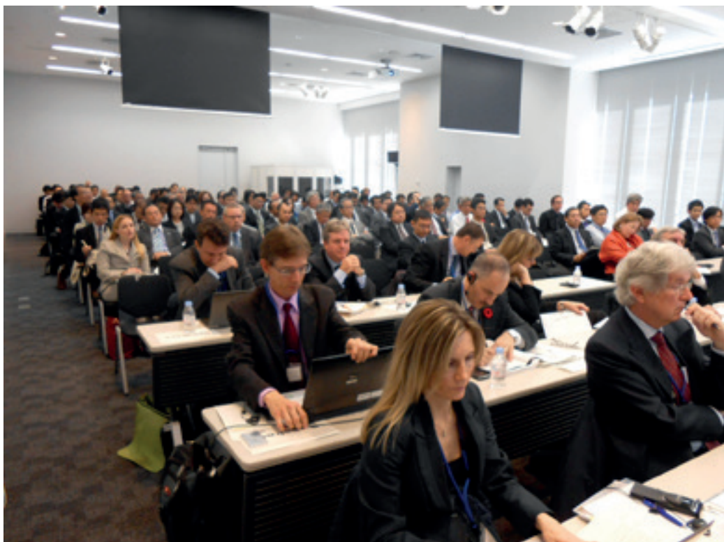
International conference "Strengthening Space Security Through a Trilateral US-Europe-Japan Partnership"