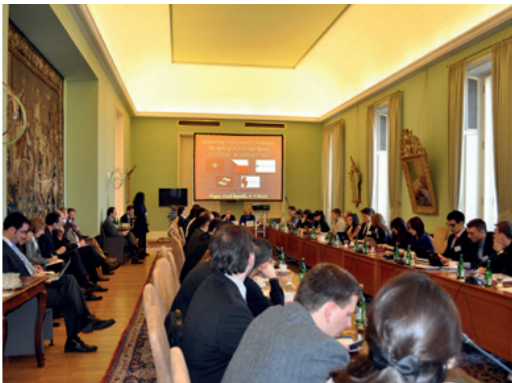
NATO Winter Academy 2013