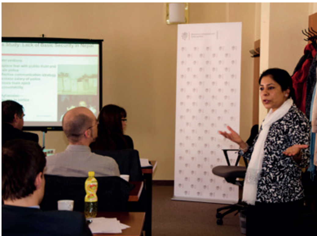
Interagency Civilian-Military Training 2013

OSCE and UN) in conflict prevention and stabilization operations; field-work preparation – mission working environment and the role of religion and cultural norms in working with local populations; the role of humanitarian and development organizations in conflict zones; and better understanding EU/OSCE Electoral Observation Missions.