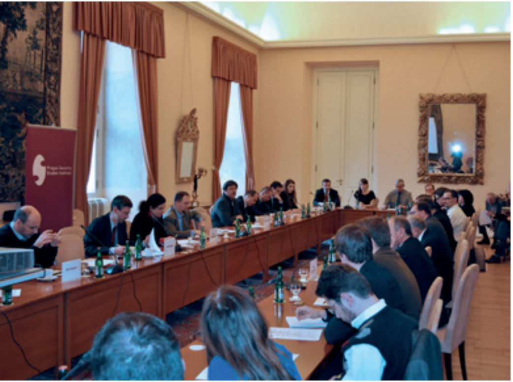
International conference "Islam and Democracy"

Muslim-Coptic relations, Islamic parties in Egyptian politics, leadership issues and the future of the peace treaty with Israel.