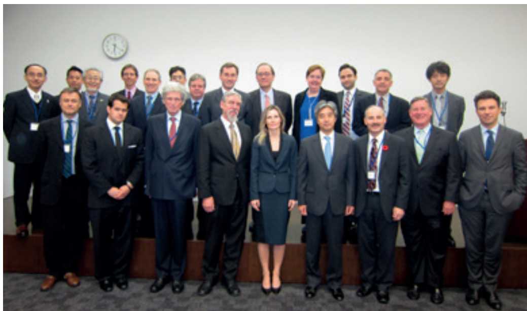
Speakers at the international conference "Strengthening Space Security Through a Trilateral US-Europe-Japan Partnership"