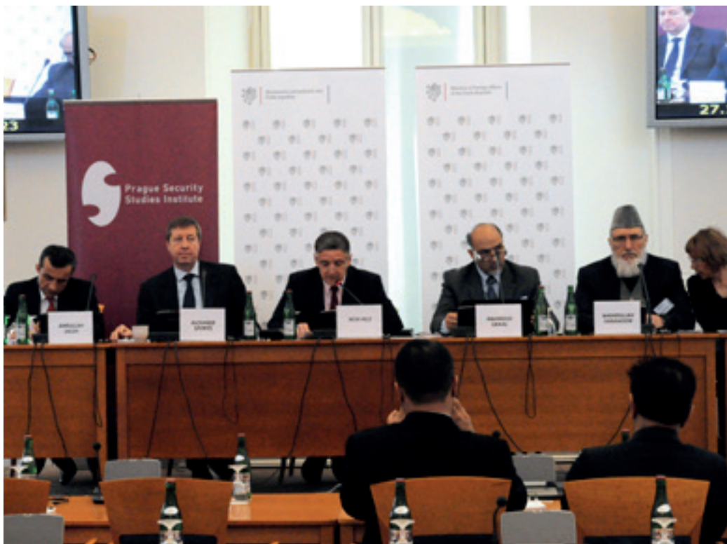
International conference "Afghanistan After 2014: The Afghan Perspective and NATO's Legacy"