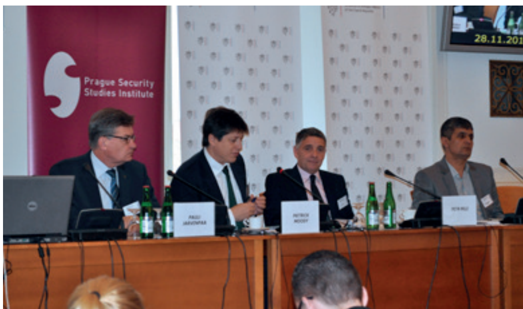
International conference "Afghanistan After 2014: The Afghan Perspective and NATO's Legacy"