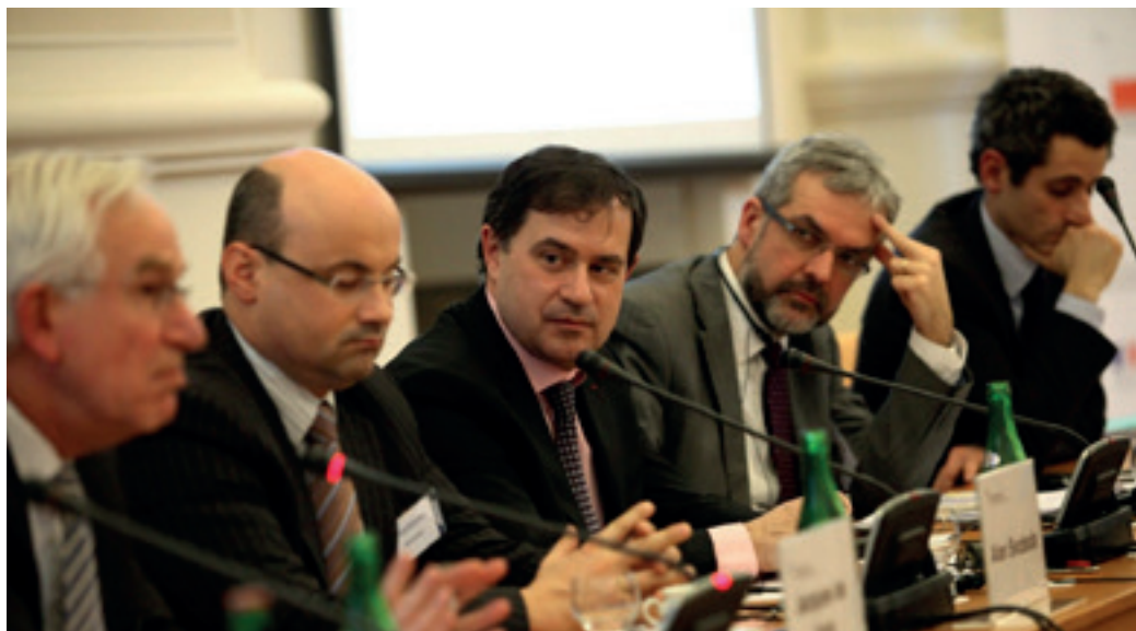
International conference "Ensuring Energy Security in Europe - the Need for a Multifaceted Approach"