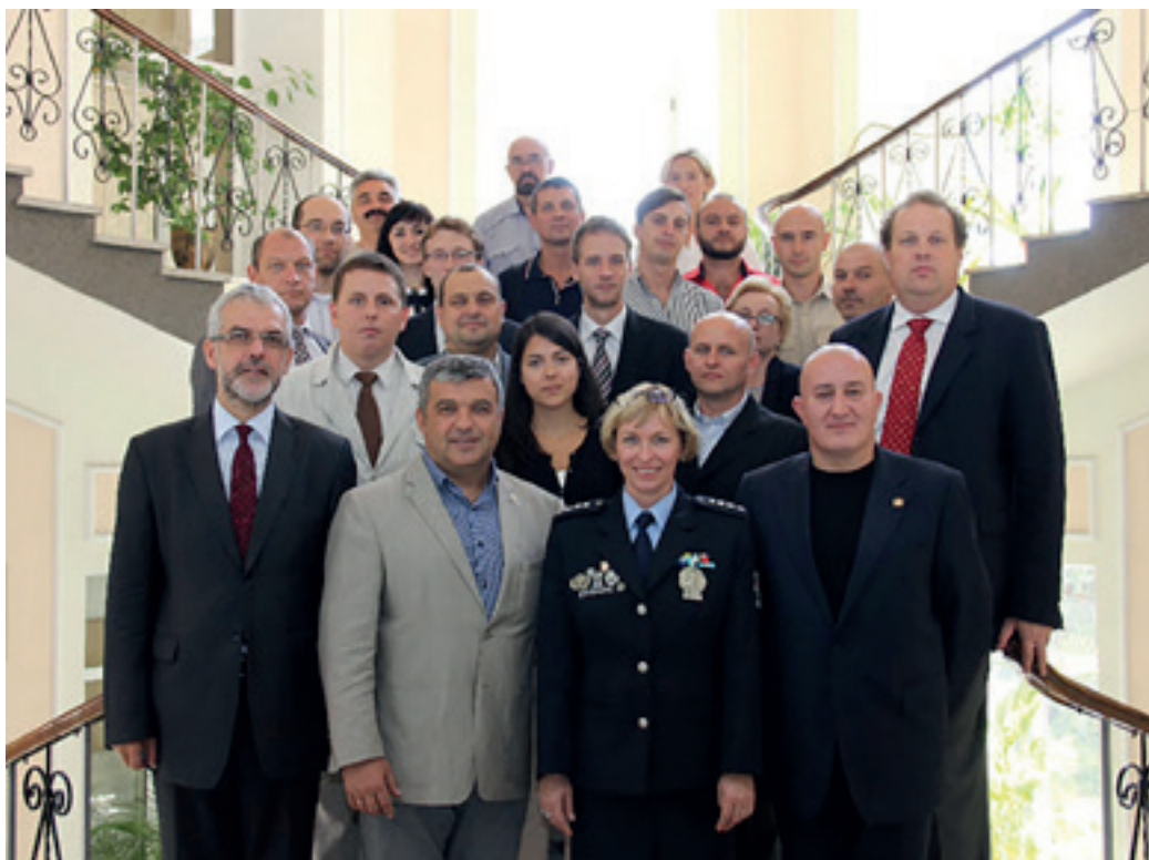
Members of PSSI with local activists and members of security community in Odessa, Ukraine during workshop on security sector reform in Ukraine.