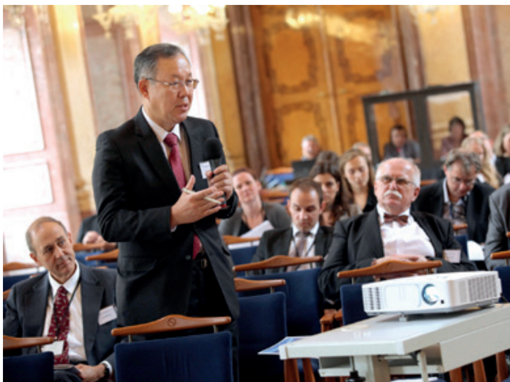
Conference "Energy Security in Central and Eastern Europe and the Operations of Russian State-Owned Enterprises".