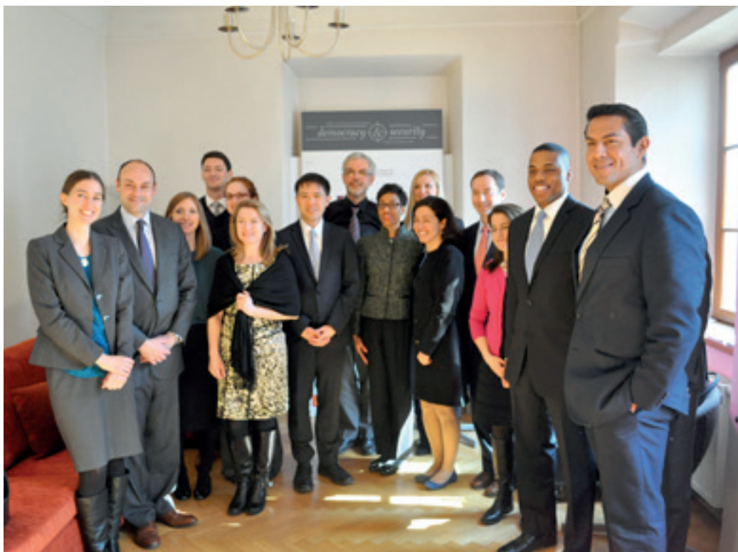
The White House Fellows visiting PSSI in March 2015.