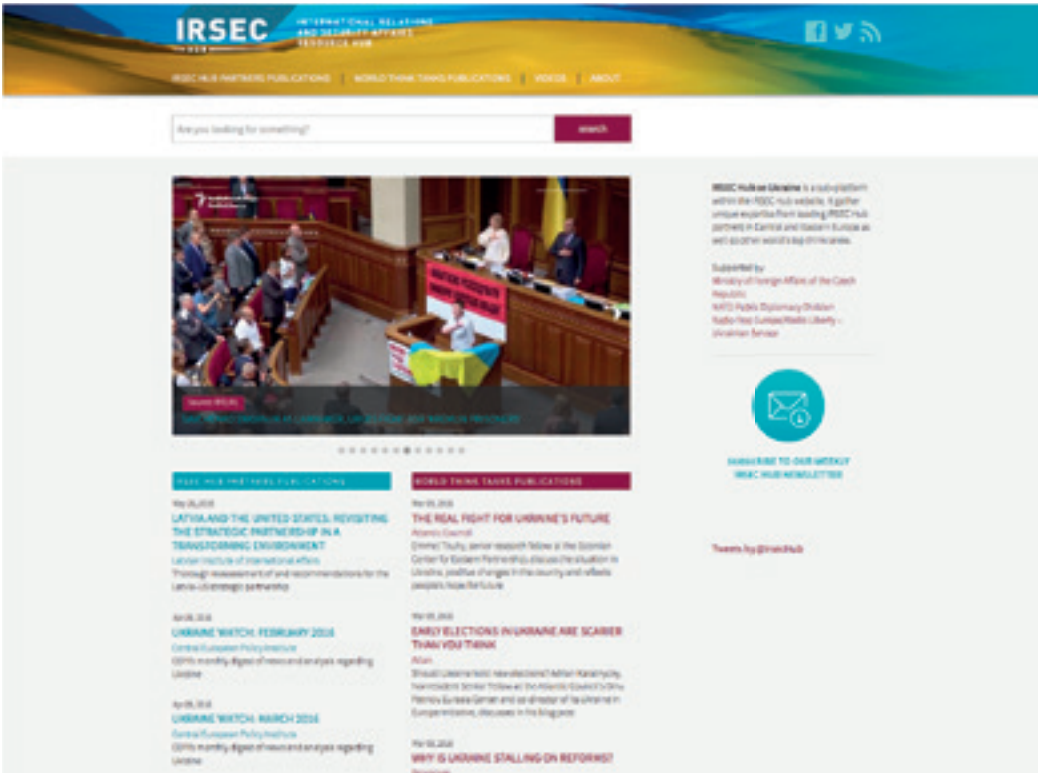
PSSI's project IRSEC Hub (International Relations and Security Affairs Resource Hub).