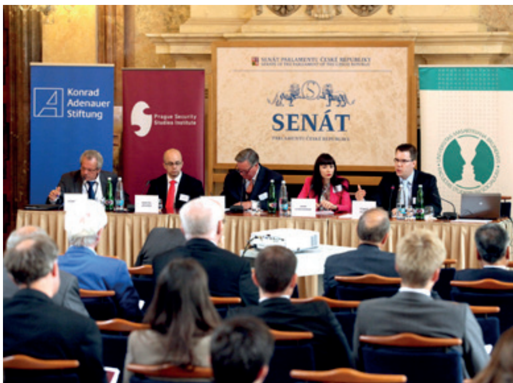
PSSI's conference on energy security "Energy Security in Central and Eastern Europe and the Operations of Russian State-Owned Enterprises".

work of energy experts and security policy practitioners, industry representatives as well as the academic and NGO communities.