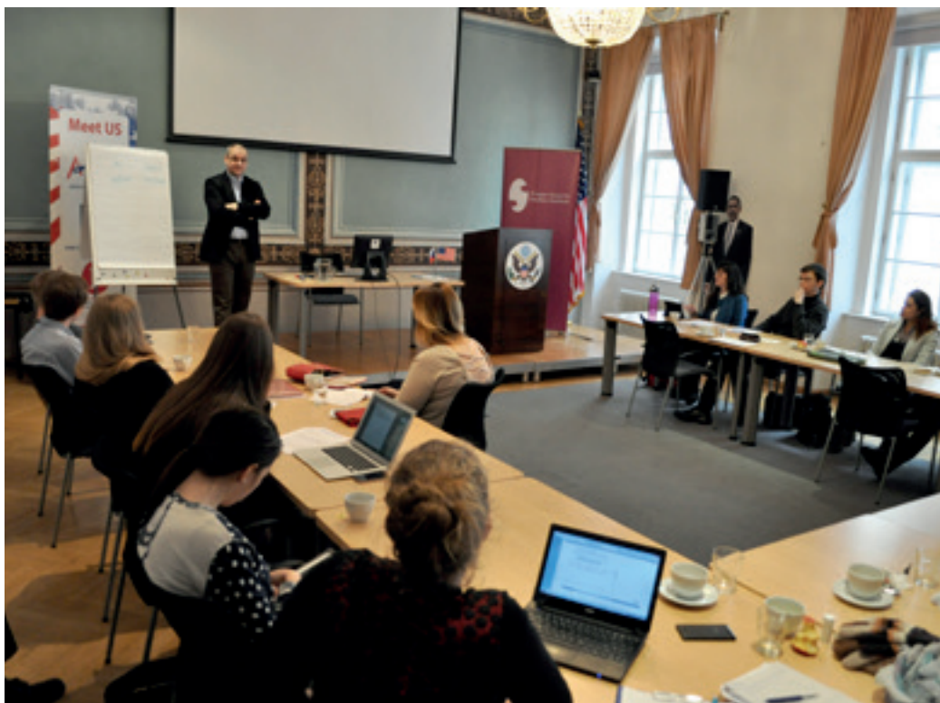
Václav Bartuška, Ambassador-at-Large for Energy Security of the Czech Republic, giving a lecture at the Energy Security Academy