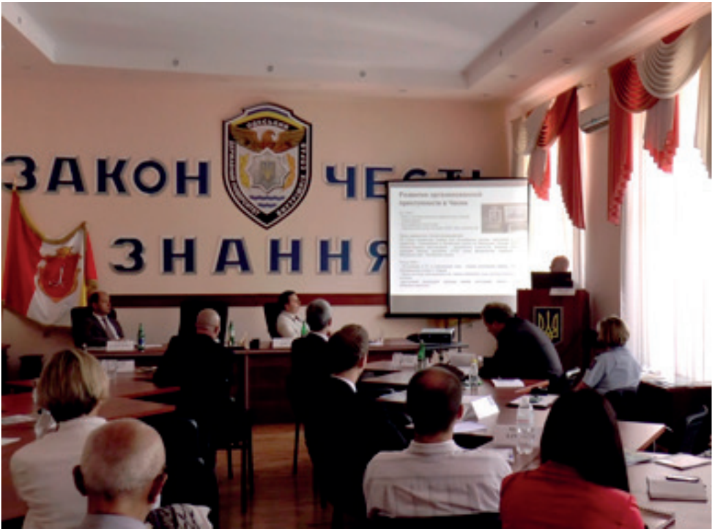
Workshop for the members of security community in Odessa, Ukraine.

"Narratives" provides a brief overview of the pro-Russian disinformation activities in the Czech Republic and Slovakia, identifies frequently used narratives, and brings attention to the similarity of arguments and messages used by a pro-Russian media with no formal links to Russia, versus media that are founded and funded by the Russian Federation. The publication is accessible on the PSSI's webpage.