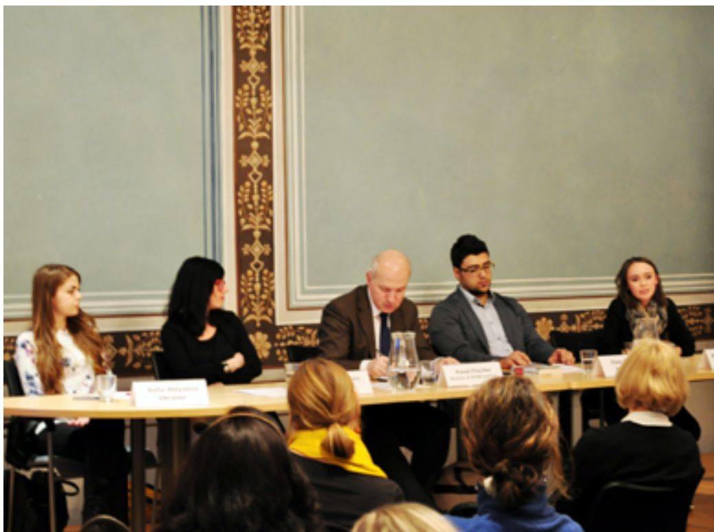
Public Lecture "Media Freedom at the EU Borders"

in order to strengthen mutual trust and develop common practices. Regional alliances, like the Visegrad Group, constitute a useful platform in this regard.