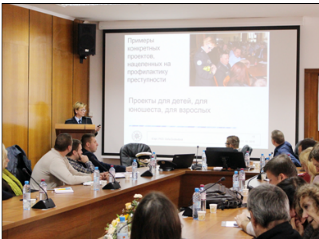
Seminar "Civil Society as an Important Partner of the Police and Citizens" in Uzhorod, Ukraine