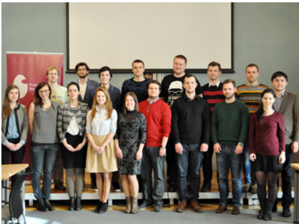
Students of PSSI's Energy Security Academy 2016