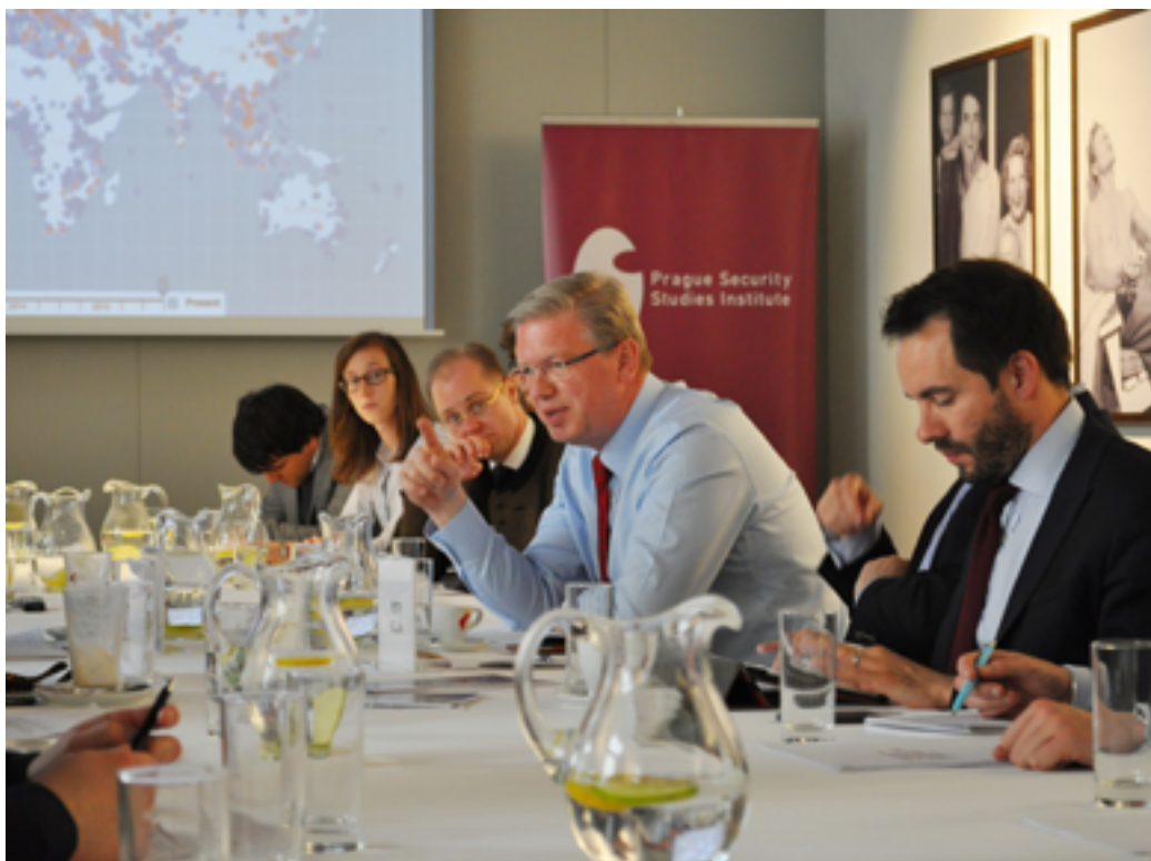
Štefan Füle, Czech Special Representative to OSCE, at the E&F Roundtable in May 2016