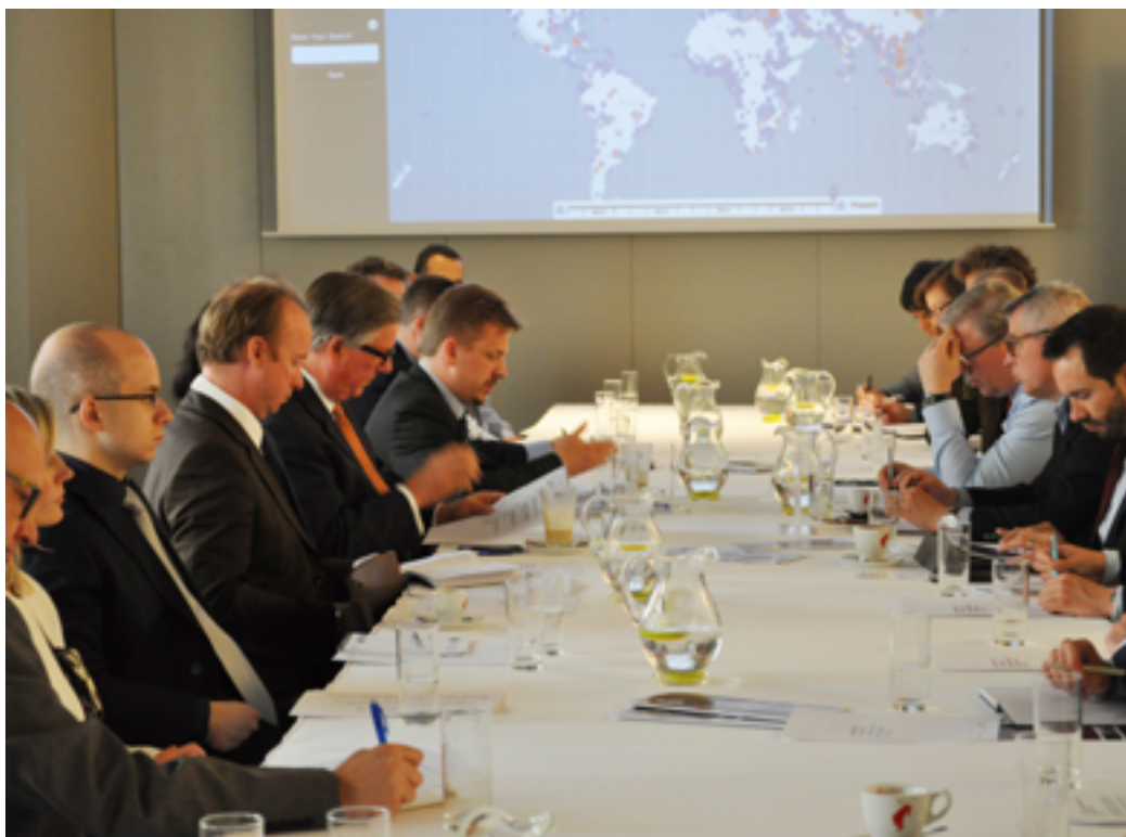
Roundtable on the Economic and Financial Threat Domain, May 2016

advance strategic and foreign policy objectives.