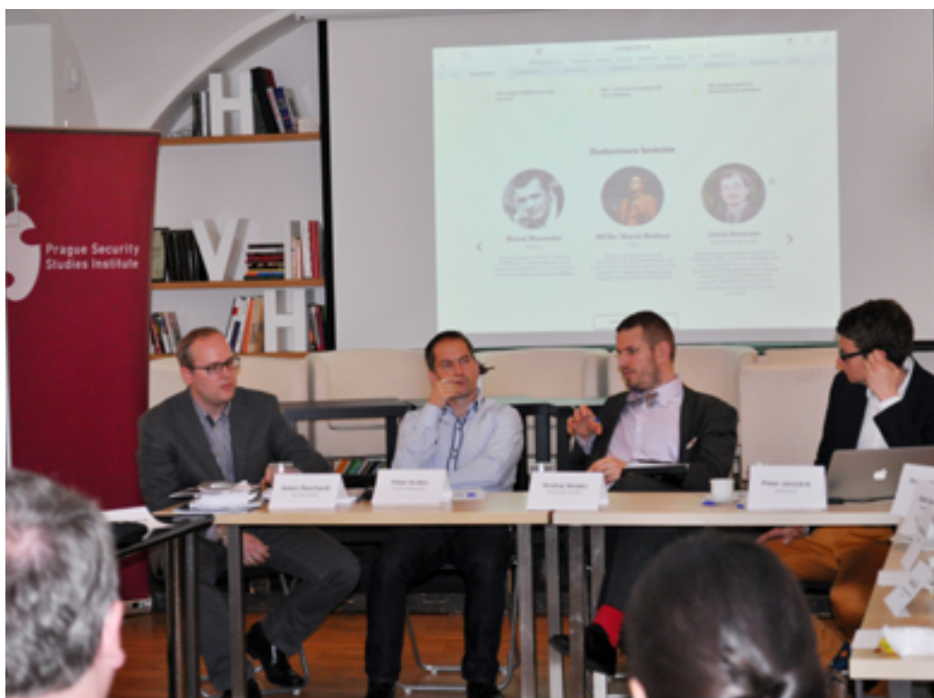
Closed roundtable "Countering Pro-Russian Disinformation" May 2016, Prague