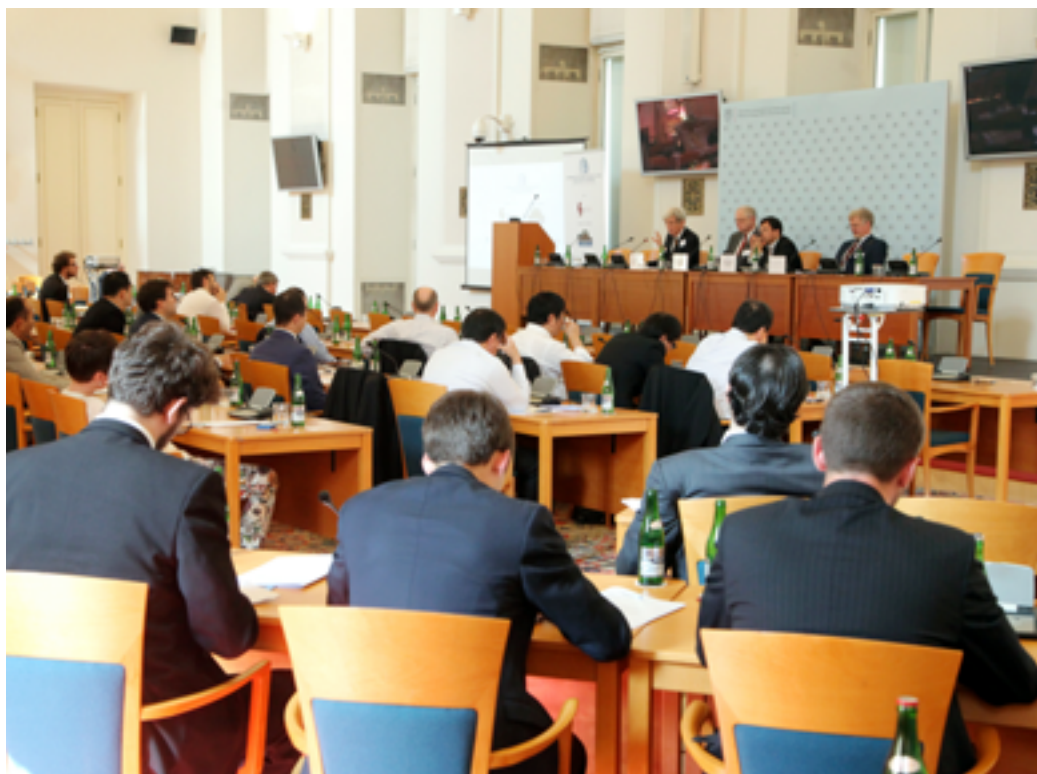
PSSI's Space Security Conference 2016

The conference, held in the Czernin Palace, Headquarters of the Czech Foreign Ministry, was attended by more than one hundred experts from a wide array of countries, including representatives from the European External Action Service (EEAS), the European Commission (EC), the U.S. Department of State, the U.S. Airforce Space Command, Japan's and France's Ministries of Defence, as well as prominent non-governmental and commercial entities, such as George Washington University's Space Policy Institute (SPI), the Center for Strategic and International Studies (CSIS), the Analytical Graphics (AGI), and Lockheed Martin Corporation.