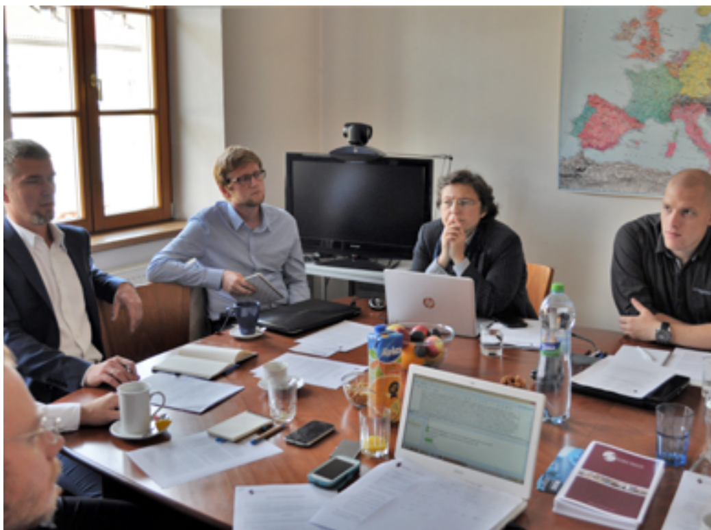
A session in the project „Raising Awareness of Russian Soft Power in Central Europe“