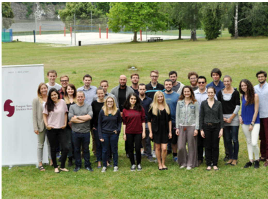
PSSI's NATO Summer School Students