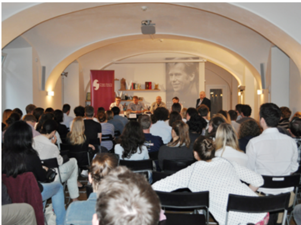
Public lecture on Russian propaganda in Ukraine at Václav Havel Library in Prague