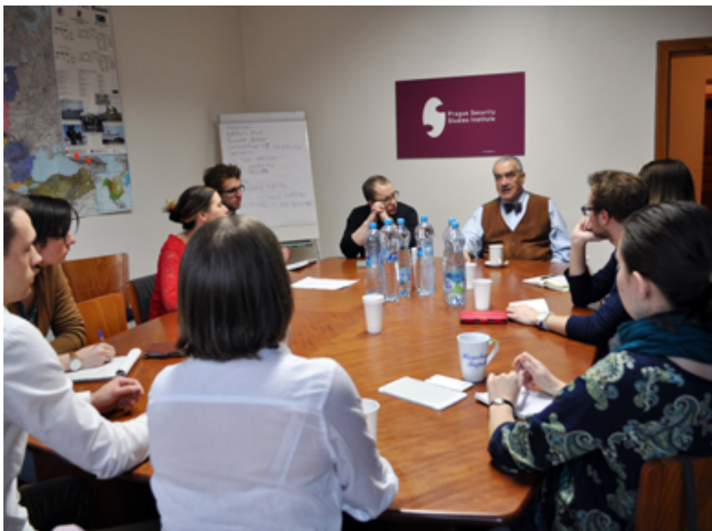
Karel Schwarzenberg, former Czech Minister of Foreign Affairs, in a discussion with Robinson-Martin Security Scholars