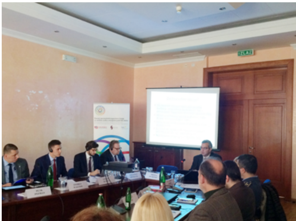
Participants in the seminar "Civilians in Multilateral Missions" held in November 2016 in Fruška Gora, Serbia

and crisis management. The project is supported by the Czech Development Agency and the principal project partner on the Serbian side is the ISAC Fund, a think-tank that promotes the transition of Serbia towards the EU and Euro-Atlantic membership.