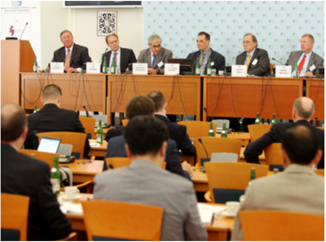
Opening Panel of the PSSI's Space Security Conference 2016