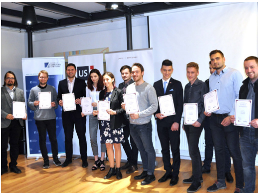
Participants of PSSI's "Security Academy for Young Politicians" program