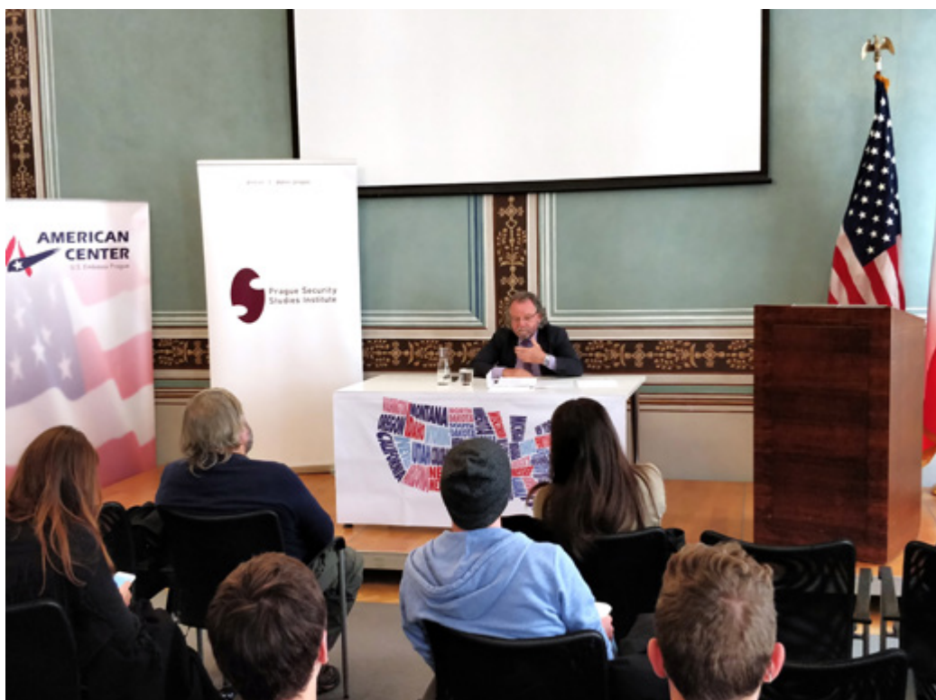
Jean-Jacques Tortora, Director of the European Space Policy Institute, delivers a lecture entitled "European Space Policy in Global Context" to students of the PSSI's MA Space Security Course

Republic. The program began in the Czech language in 2007 and achieved English-language accreditation in 2012.