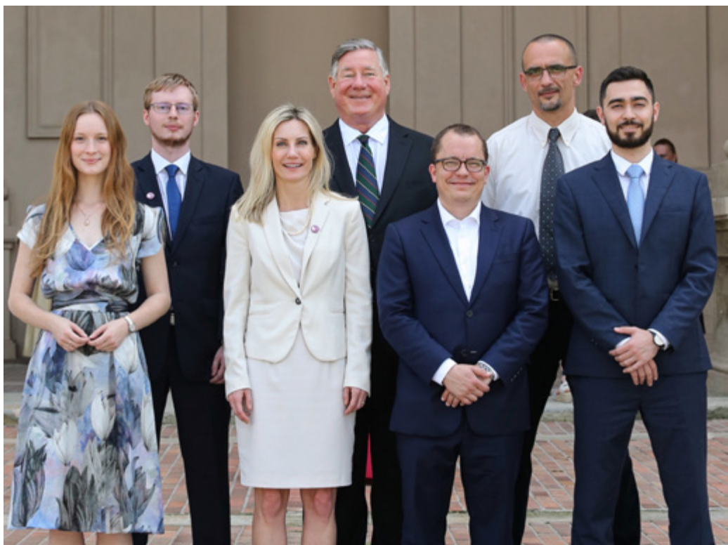
The Prague Security Studies Institute's team at the Fifth PSSI Space Security Conference