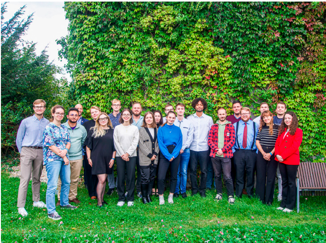
Participants of the 7 th Cyber Security Academy.

rights dimensions of global finance, and a host of other issue areas.