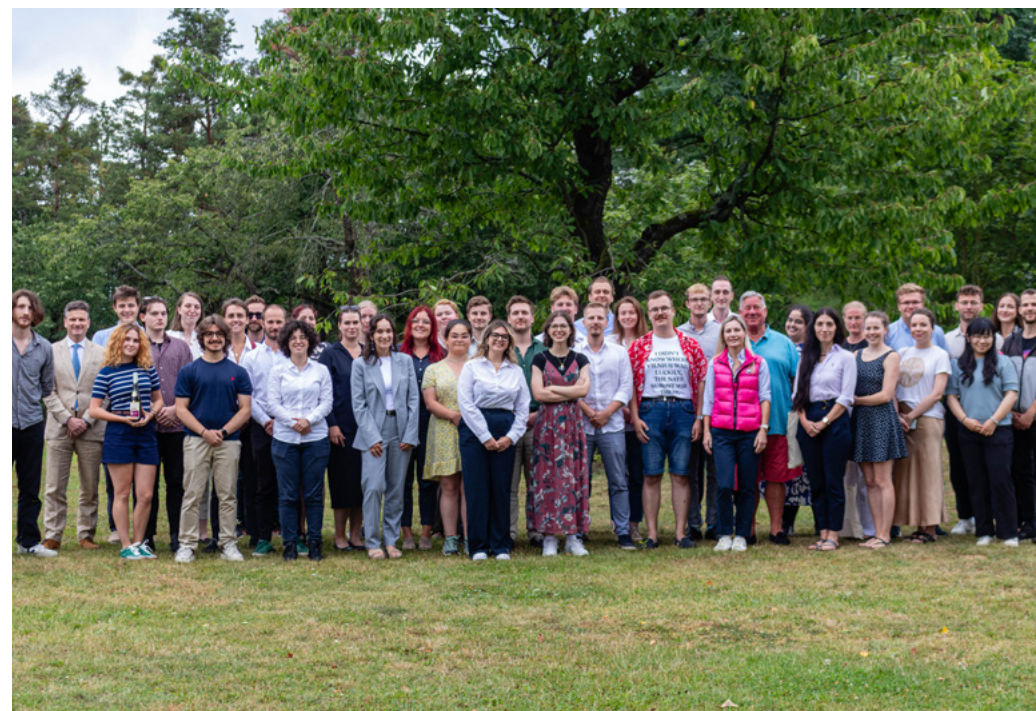
Participants of the 19 th NATO Summer School