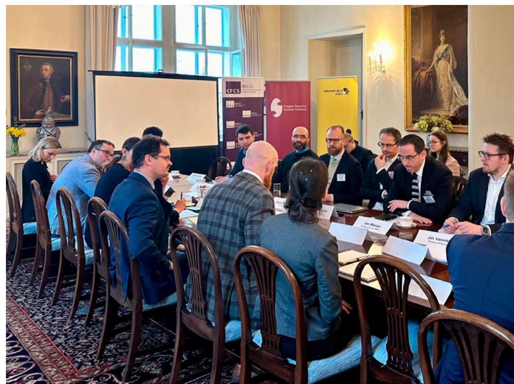
Participants at the roundtable on increasing the effectiveness of sanctions against Russia, held at the British Embassy in Prague.