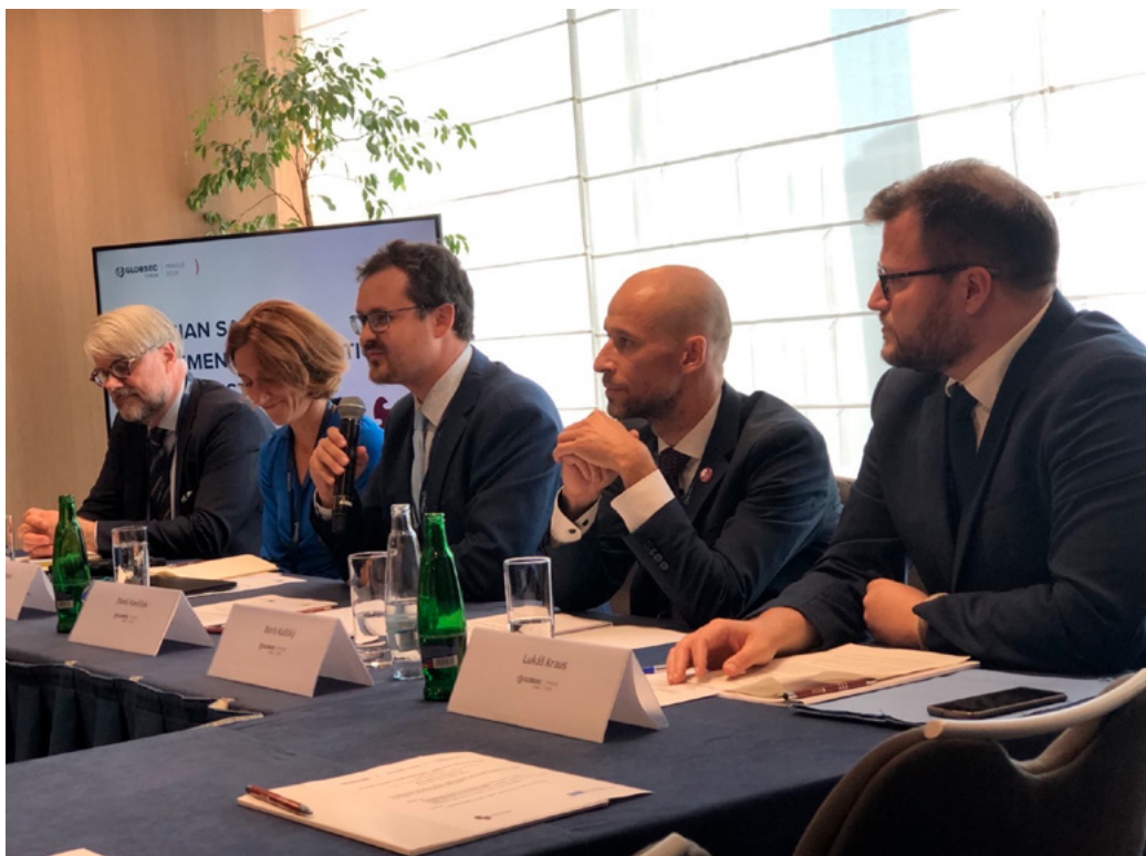
Roundtable on the implementation of sanctions against Russia, held at the GLOBSEC Forum.

of issuing and implementing sanctions against Russia and analyzed the current shortcomings. They discussed implementation differences among the participating nations, cooperation and information sharing across countries and between public and private entities, available tools to strengthen sanctions, and their effect on the capacity of Russia to wage war.