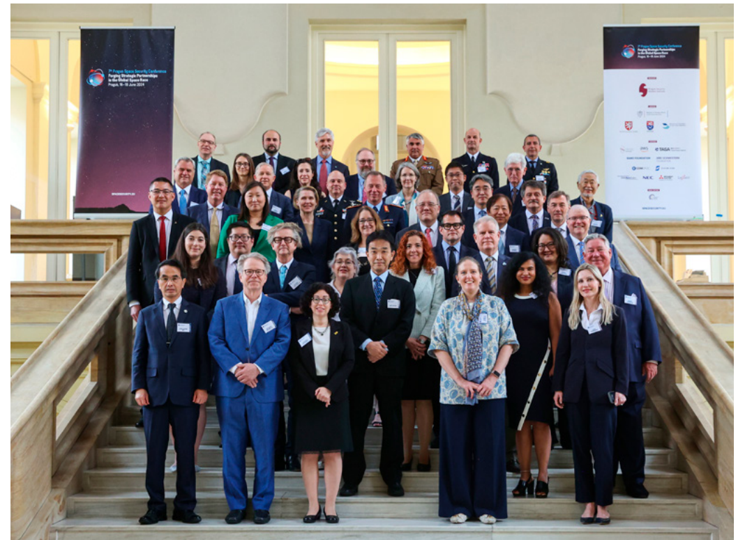
Speakers at the 7 th Prague Space Security Conference, entitled "Forging Strategic Partnerships in the Global Space Race".

industry leaders, and experts to discuss Europe's economic future, competitiveness, and strategic challenges. He engaged in discussions on Europe's evolving economic security strategy, particularly its shifting stance on China and the progress towards a Capital Markets Union, and helped align PSSI's ongoing efforts to explore and address the strategic risks posed by global competition with the latest EU policy developments and strategic initiatives.