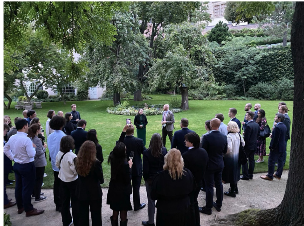
Reception hosted by the British Embassy in Prague.

Among our alumni, a number of Czech security experts, scholars, and policy-makers have become prominent figures in