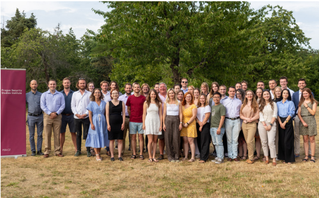
Participants of 18 th NATO Summer School, 2023