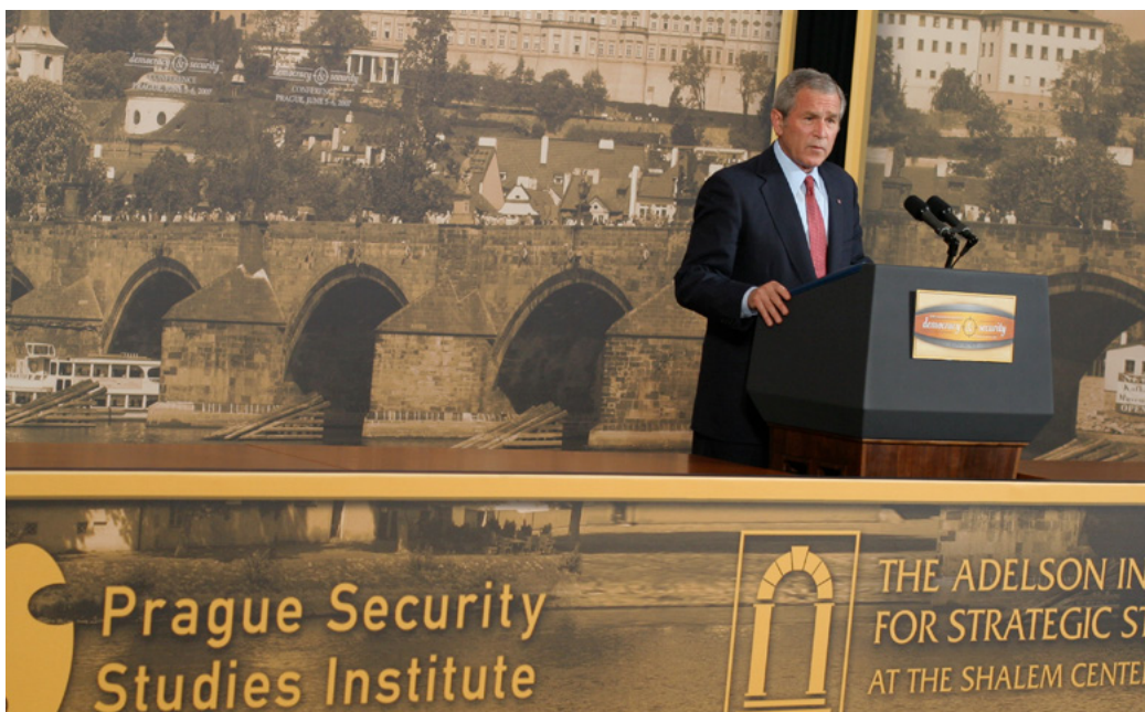
President George W. Bush's address at the Democracy & Security International Conference, 2007