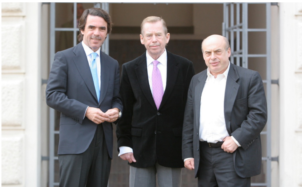
José María Aznar, Václav Havel and Nathan Sharansky at the Democracy & Security International Conference, 2007