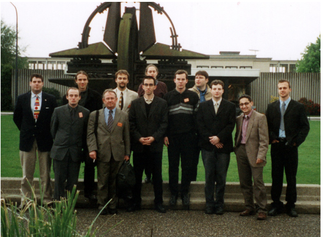
First Robinson Martin Security Scholars Program participants' field trip to NATO headquarters, 2002