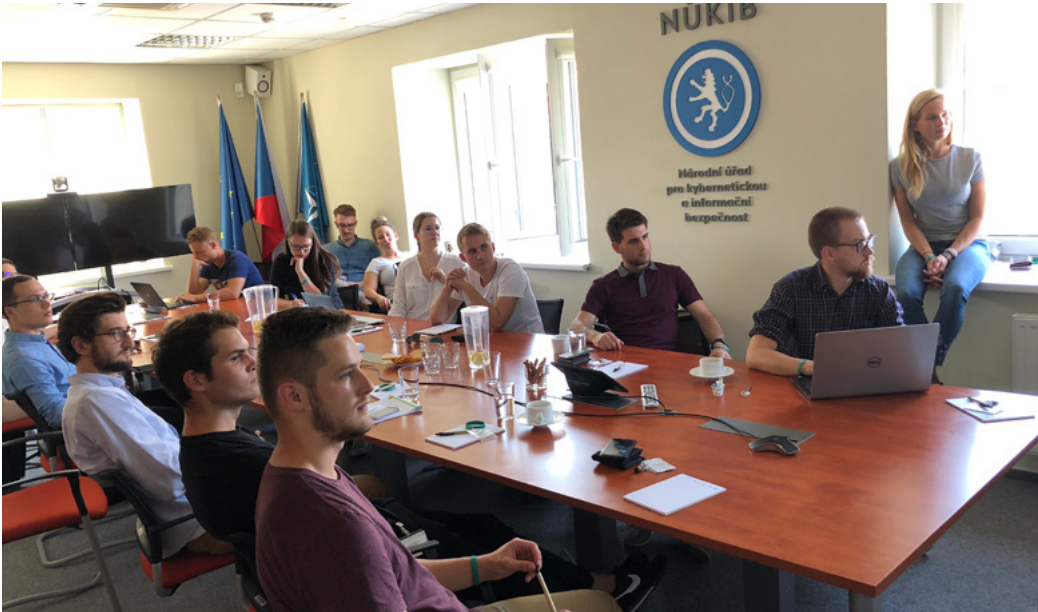
Students of the first PSSI Cyber Security Academy visiting National Cyber and Information Security Agency, 2018