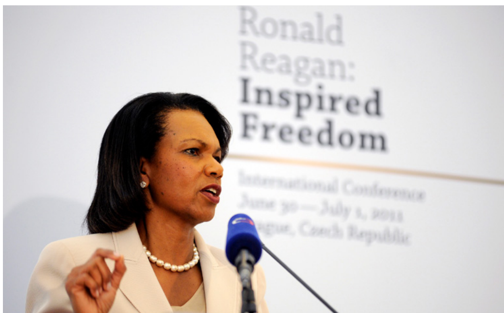
Former Secretary of State Condoleezza Rice speaking at the conference Ronald Reagan: Inspired Freedom in 2011