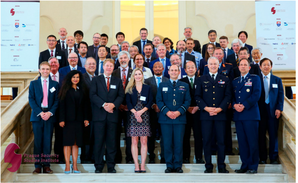
Speakers of the Sixth PSSI Space Security Conference, 2022