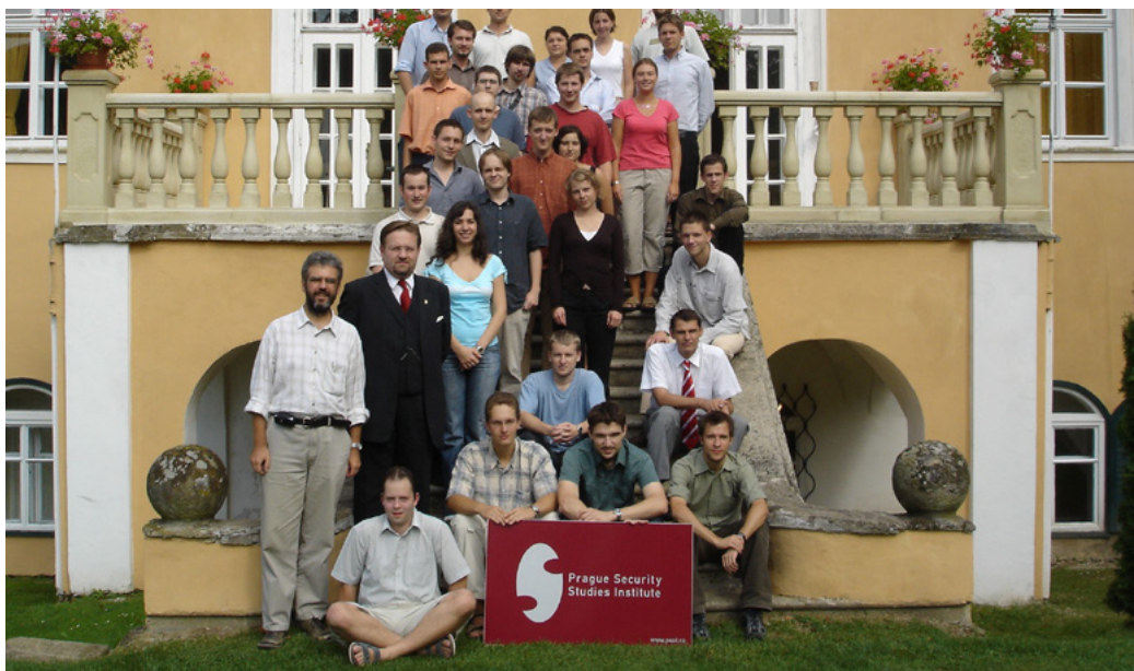
First PSSI's NATO Summer School, 2005