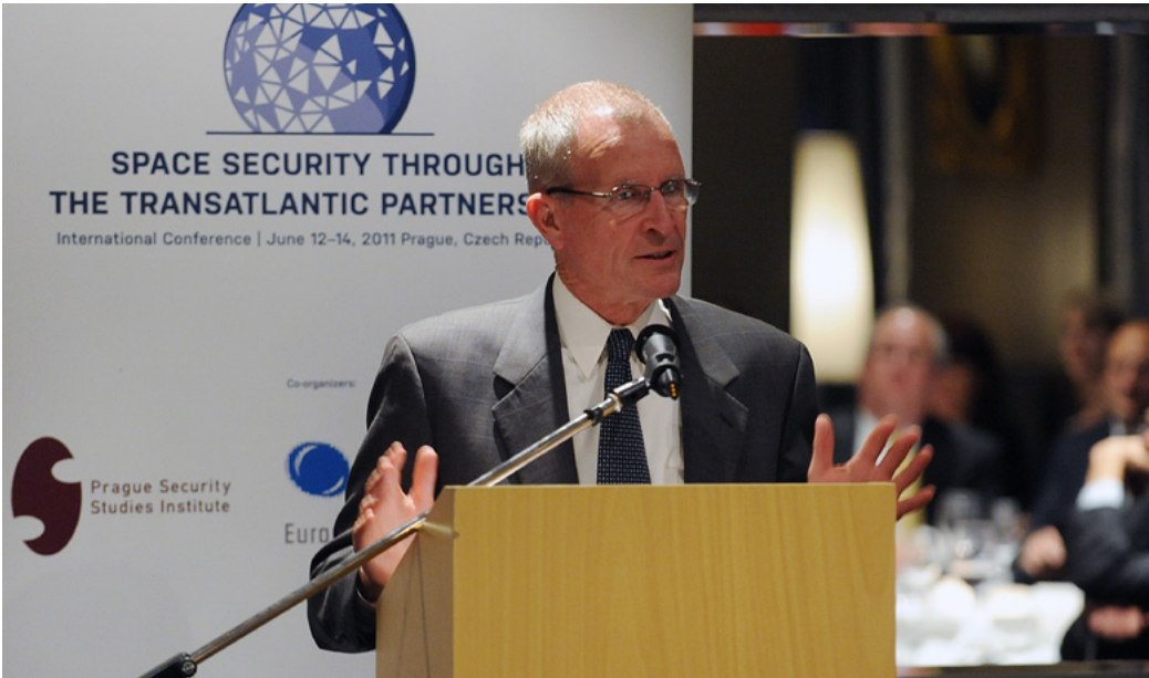
Former Director of National Intelligence, Admiral Dennis C. Blair, U.S. Navy (Retired), addresses PSSI's First Space Security Conference, entitled Space Security Through the Transatlantic Partnership, 2011