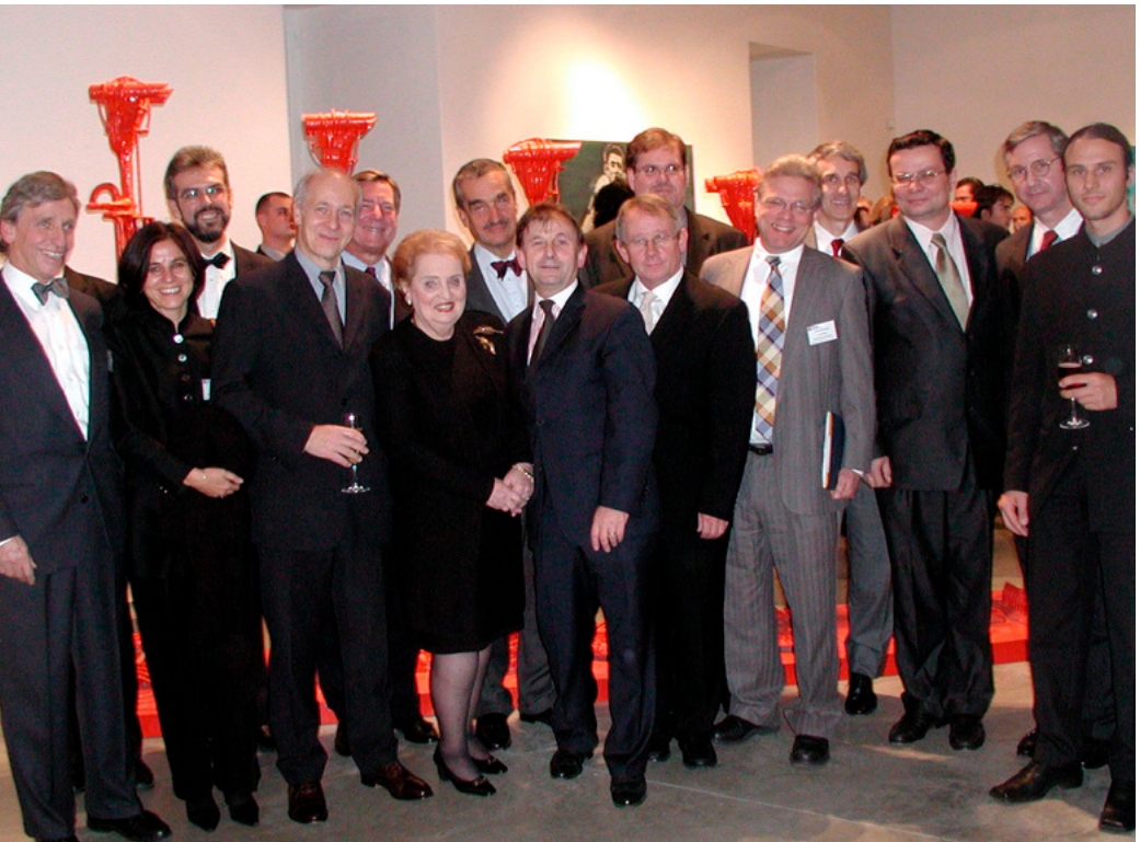
Participants of the Program of Atlantic Security Studies Conference in 2004

Spencer Foundation, Donner Foundation, Drei Schwestern Foundation, Eastern Partnership for Civil Society Forum, Embassy of Afghanistan in Prague, Embassy of Denmark, Embassy of France, Embassy of Israel, Embassy of Japan, Embassy of Norway, Embassy of the Kingdom of Norway, Embassy of the Netherlands, Embassy of the United States, European Commission Representation in Prague, European Media and Information Fund, European Social Fund, European Space Agency, European Space Policy Institute, Europeum – Institute for European Policy, Eurotel, Foundation for Social Studies and Analysis, Fondation pour la Recherche Stratégique, Foundation for Strategic Research, Friends of Israel, Fundacja Prospect, Geneva Centre for Democratic Control of Armed Forces, German Aerospace Center, German Marshall Fund of the United States, GLOBSEC, Harris Corporation, Heinrich Böll Stiftung, IHI Aerospace Co., Ltd., Institute for Public Policy, Interdisciplinary Center Herzliya, Interel, International Relations and Security Network, International Republican Institute's Beacon Project,