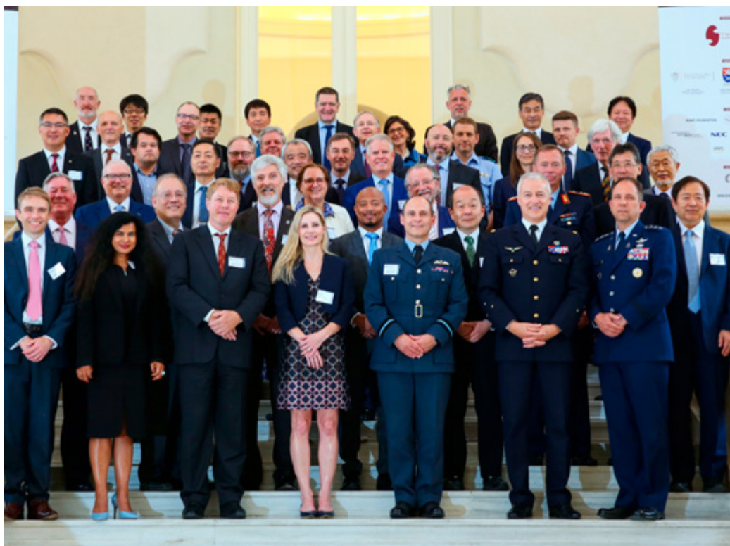
Speakers of the 6 th PSSI Space Security Conference in Prague entitled "The Global Space Competition: Security, Markets and Sanctions"