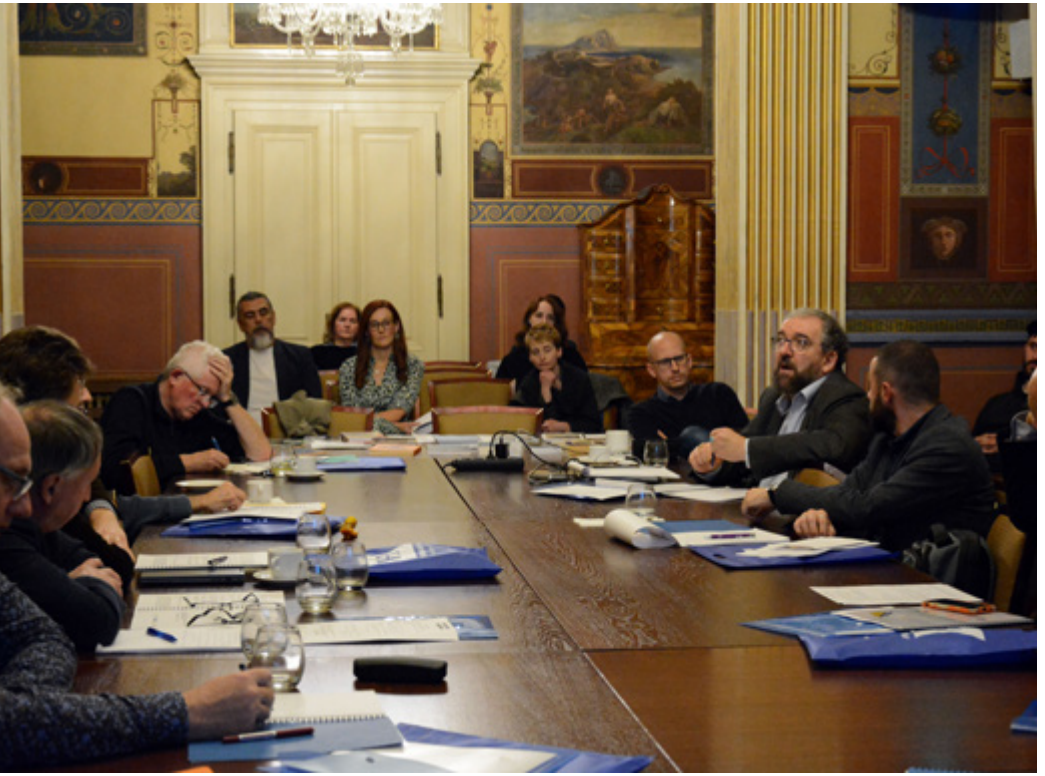
International conference Bosnia and Herzegovina: Post-Colonial and Post-Conflict Heritage of a European State, Prague 2022