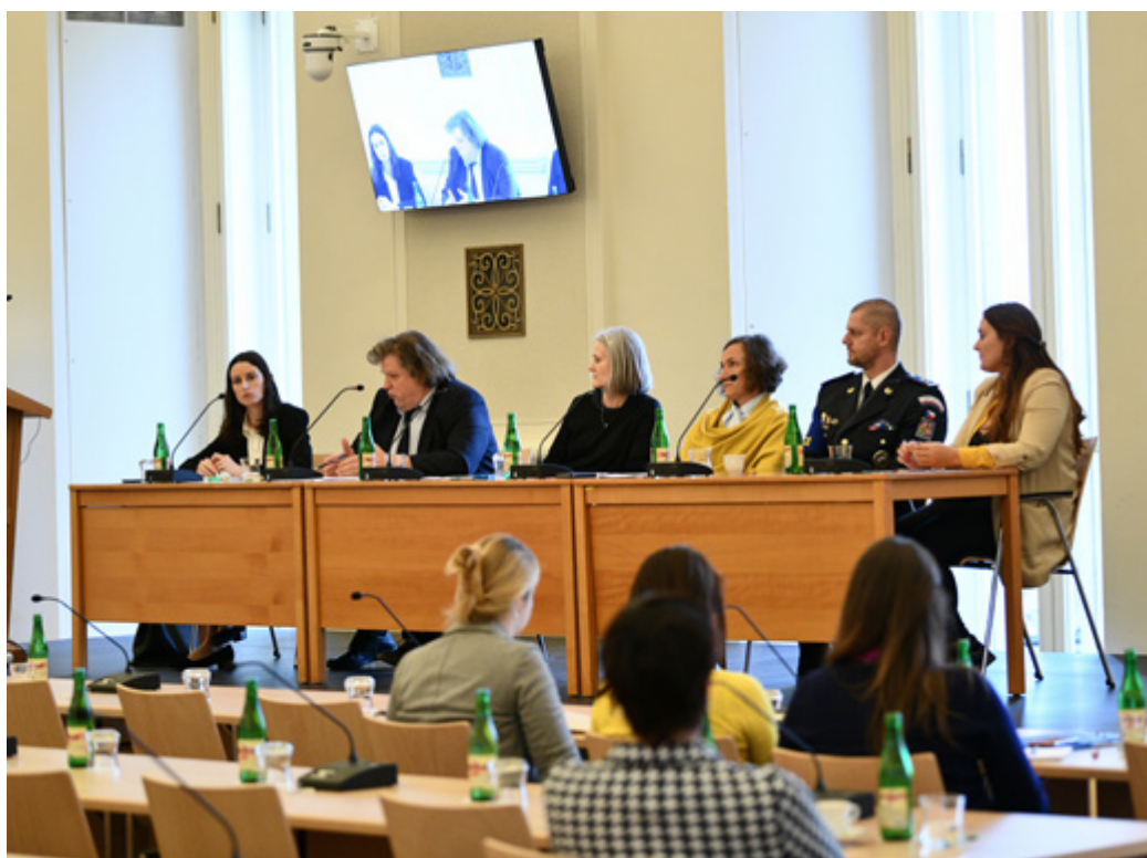
Panel of experts during a conference on Czech civilian missions

ing work of Czech civilian experts, to strengthen the Czech Republic's involvement in civilian missions within the framework of the EU Common Security and Defence Policy, and, most importantly, to share information and experiences that could contribute to greater involvement of Czech NGO experts from various fields. Those interested in working in EU civilian missions were informed about how and where new opportunities are advertised, the practical aspects of the selection procedure, how to prepare for missions and the missions themselves.