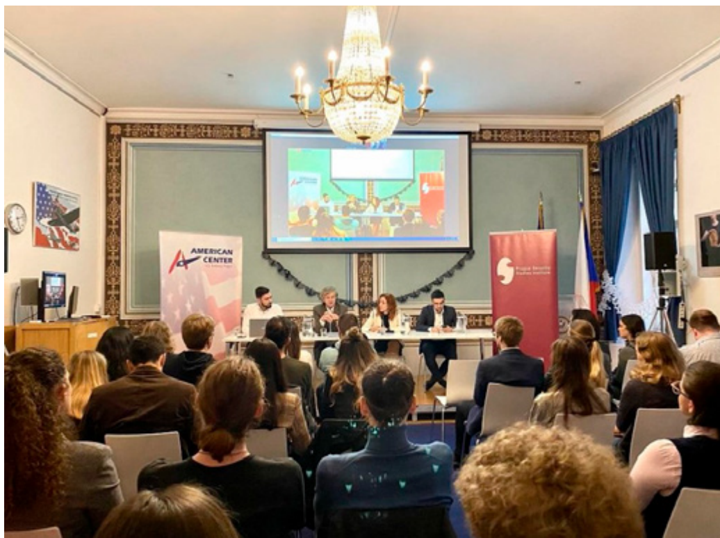
The Private Sector Role in the New Global Space Race, roundtable discussion

Department of North American Studies at Charles University.