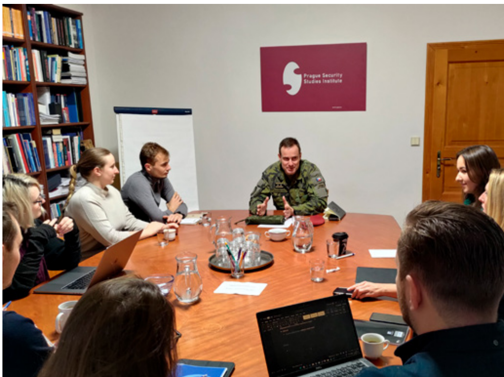
General Karel Řehka, current Chief of the General Staff of the Military of the Czech Republic, delivering a lecture for the Robinson-Martin Security Scholars Academy

young professionals from NATO and partner countries to participate in lectures, interactive workshops, and a “real world” simulation. In July 2022, PSSI successfully organized its 17 th NATO Summer School, entitled “The Evolving Dynamics of the Russian and Chinese Threats”. This week-long course at a campus retreat outside Prague (at Hotel Orlik) facilitated expert lectures in PSSI’s priority policy areas, including cyber security, space security, economic and financial threats, and disinformation. The 2022 NATO Summer School program consisted of 13 lectures and workshops, as well as a week-long crisis simulation, hosting 25 participants from 13 NATO countries.