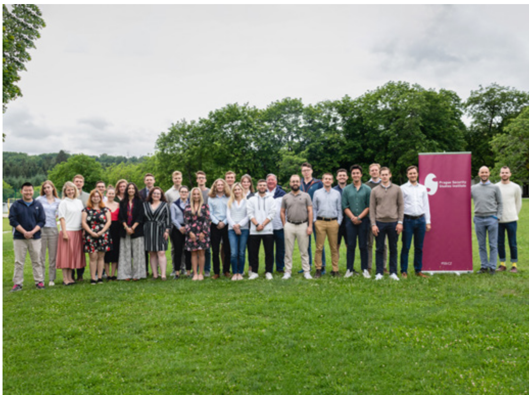
Participants of 17 th NATO Summer School