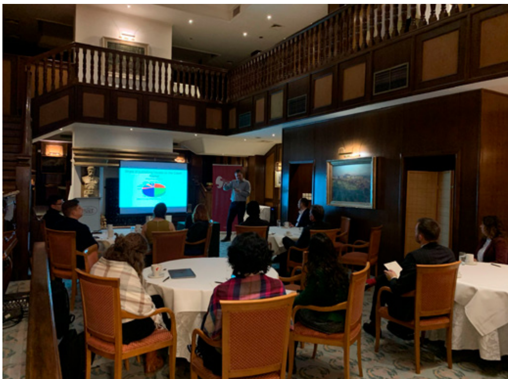
Seminar on disinformation and brand safety co-organized with the British Chamber of Commerce

Republic, which included representatives of the Office of the Government, European Commission, and the NGO sector.