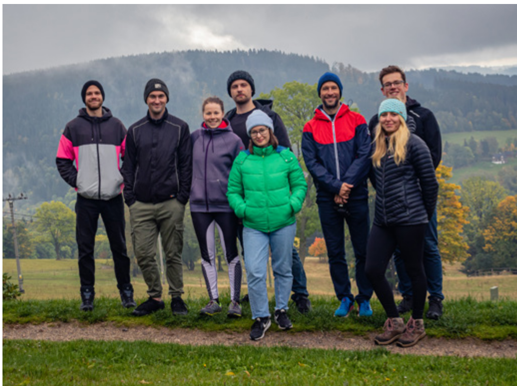
RMSSA students at alumni weekend gathering held in Jizera Mountains