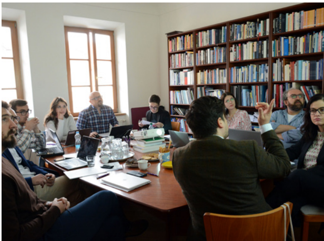
PSSI Regional Security Program's Western Balkans team workshop, Prague 2022

of nationalism, political and religious populism, and historical revisionism. It also seeks to identify disinformation campaigns, corruption of political decision-makers, and highlight economic and financial activities which have fueled the rise of extremist and radical tendencies in the Western Balkans and Croatia.