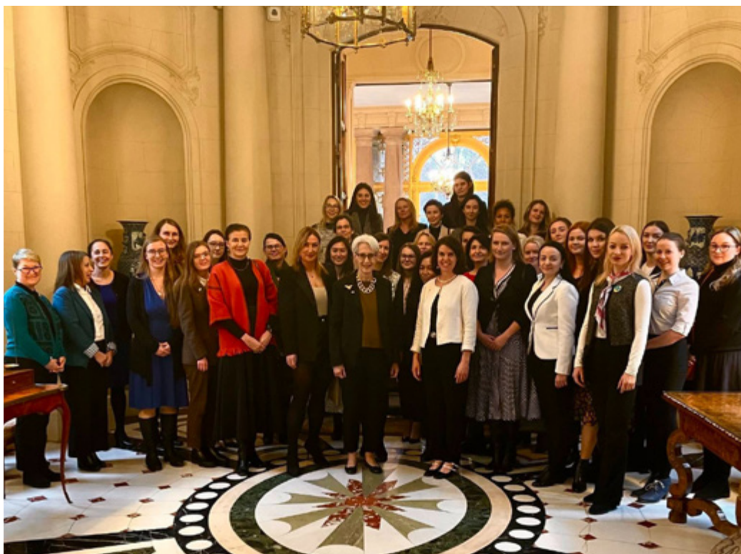
Celebrating the legacy of Madeleine Albright, former U.S. Secretary of State, with the U.S. Deputy Secretary of State Wendy R. Sherman