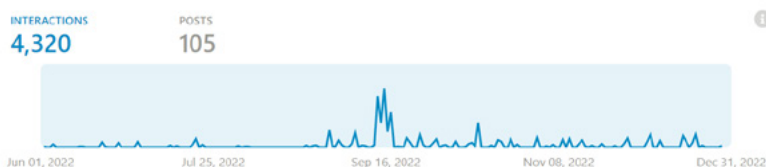
Number of interactions on government institutions' posts (June—December 2022).

Government institutions were among the most inactive sources we monitored, although once they posted on social media, they managed to attract more attention than the specialized media. However, during the seven monitored months we only identified 93 posts from government institutions relevant to the topic, which makes up only 24.7% of the overall number of analyzed stakeholders' posts. These contributions focused more on energy issues rather than the Green Deal and the environment, with an activity and interactions peak in September when the institutions provided information on measures to deal with the energy crisis, including the imposition of a price cap. Another focus were the activities of the Czech presidency of the Council of the EU and appearances of Czech policymakers at various conferences.