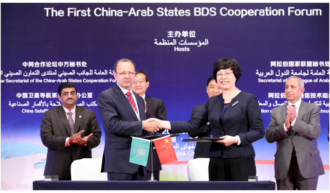
The First China-Arab States BDS Cooperation Forum<sup>43</sup>

place through the Forum on China Africa Cooperation (FOCAC) and the China-Arab States Cooperation Forum (CASCF).